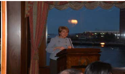
Keynote Speaker Attorney General Martha Coakley delivers a compassionate speech on the state of the sub-prime mortgage / housing crisis.