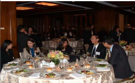
Boston Harbor Hotel provided the perfect ambience for the night with great service, fantastic cuisine and serene views of the harbor.