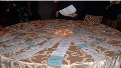
Name tags patiently await their owners.