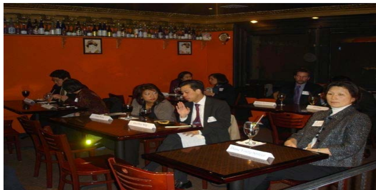
Mentors brace themselves before the first group of students and junior attorneys arrive.