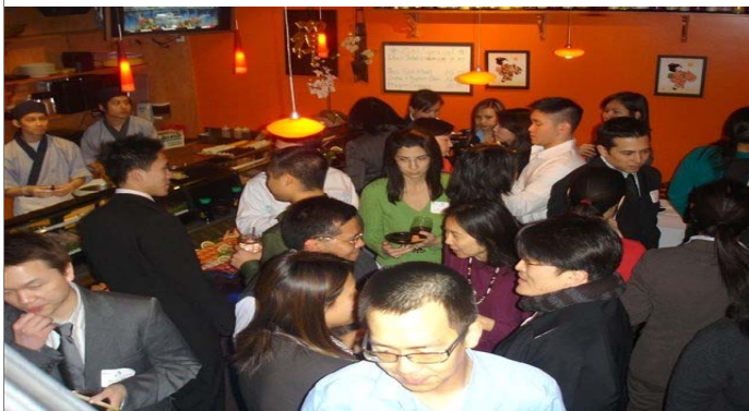
Law students and junior attorneys mingle on the first floor of Zen before their numbers were called.