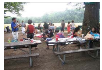
AALAM member, families and friends enjoying the picnic at Houghton's Pond.