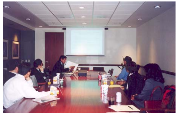
AALAM members enjoying the presentation